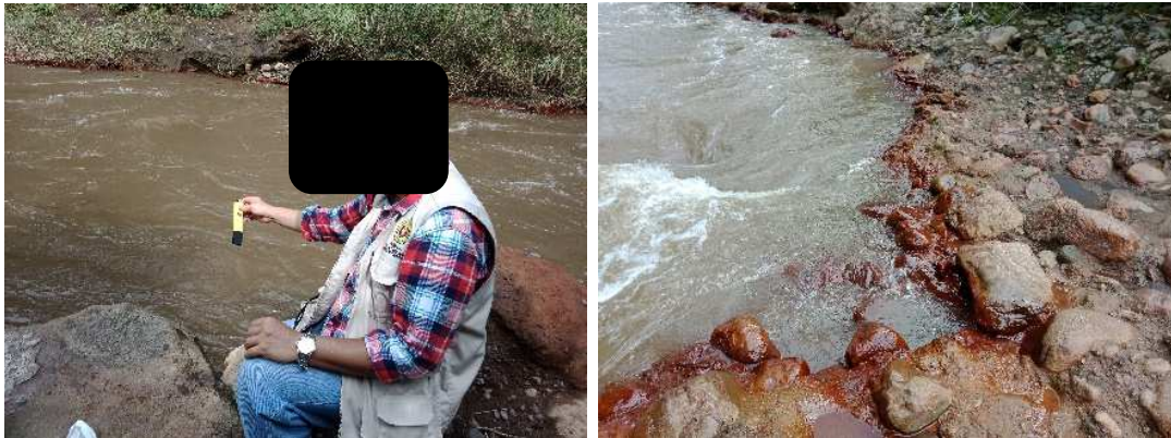
FIGURE 2. The pH measurement of Banyupait river water (left image). The river's ground rocks have oxidation due to acidic water reactions (right image).