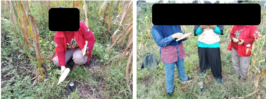
FIGURE 3. Shows some measurements of soil pH at the location around the Banyupait river.

From the results of soil pH distribution plot ( FIGURE 5b ) indicates that soil pH from upstream of the river to coastal coast showed increased pH. At the upstream of the river, Banyupait acid water was very acidic. so the soil pH of the farm fields also becomes acidic. However, it was different from the towards the downstream river. In the downstream part, there is a water mixing both from water wells/artesian wells and mixed with household waste. So, the water flowing in the irrigation has a dilution making the pH more and more ground in the neutral direction.