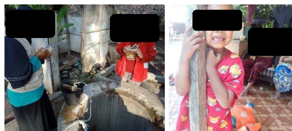
FIGURE 4. Measurements of soil pH at the location around the Banyupait river and the 6-year-old boy who affected F by exposing brown spots.